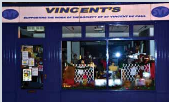
The St. Vincent de Paul shop at 12 Church St, Enniskillen

"We are so grateful for the supply of oil. We were fearful of being without heat in these cold winter days. We cannot thank you enough."