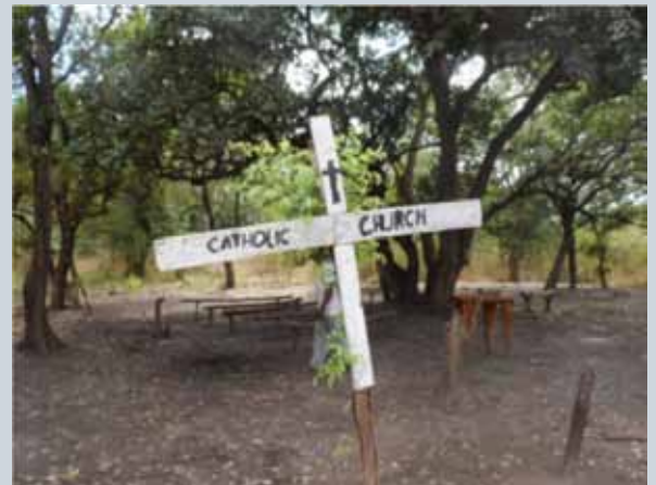
One of our Out-Stations